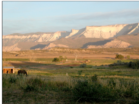
Colorado's scenic Roan Plateau could host as many as 3,200 oil and gas wells under a plan announced recently by Bill Barrett Corp. Environmental groups are challenging the Bureau of Land Management's environmental analysis of drilling activities in the region.